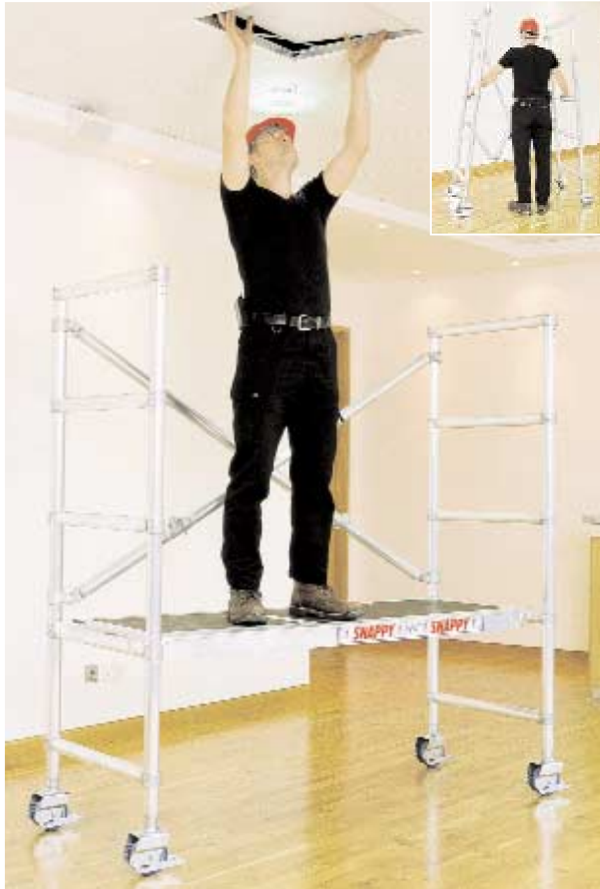
Snappy 400 simply snaps into position and is ready to use in seconds.

* For platform heights over 2m guardrails must be fitted