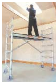
Snappy 300 is a highly versatile workstand for a variety of applications.