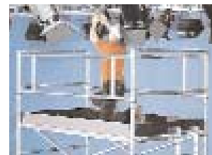
Large working platforms provide all round protection and safe working areas.