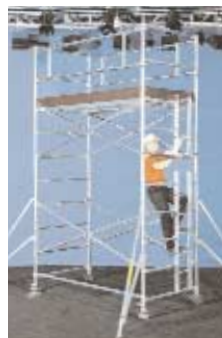
The versatility of the Span 400 ladder frame enables fast access to all areas with ease.