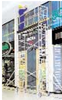
Span 400 Narrow ladder frame tower systems are fast and easy to erect and ideal for maintenance indoors and outdoors.