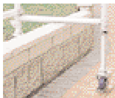
The adjustable leg makes easy work of uneven site locations.