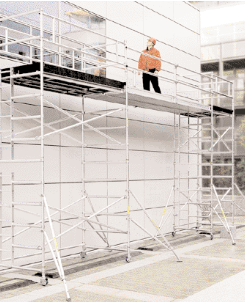
Span 400 Wide towers can be bridged with Spandek staging to provide large, safe working areas.